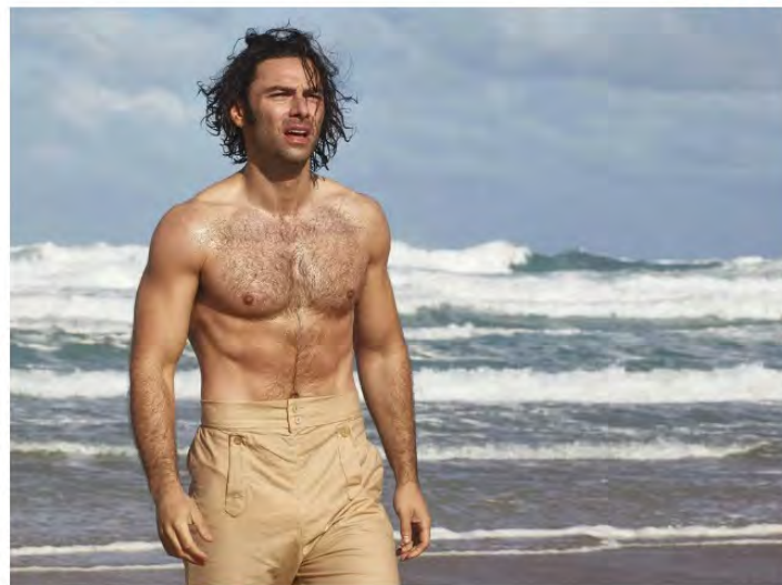
Poldark: attracting visitors to Cornwall (BBC)